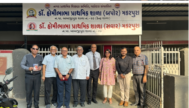
+ Glimpses of the BOD Meeting - 20th Sep 2024+